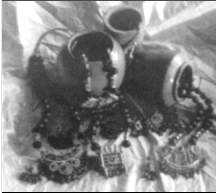
Each piece of jewelry is a work of art