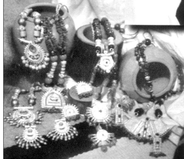
Abrar's neckless collection is rich in variety and design