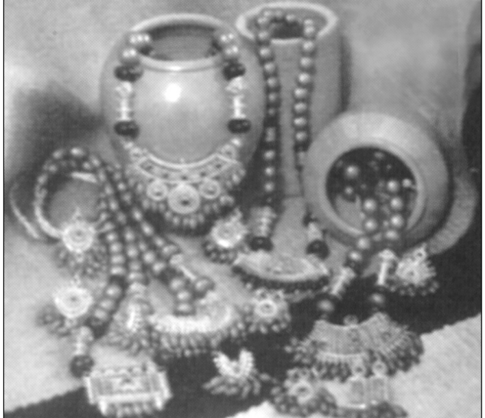
Abrar draws his inspiration from traditional Indian jewelry

His exhibition, at the WVA auditorium at house no 20, rd no 27 (old) of Dhanmondi, remains open to all from 3.00pm to 8.00pm everyday until December 7.