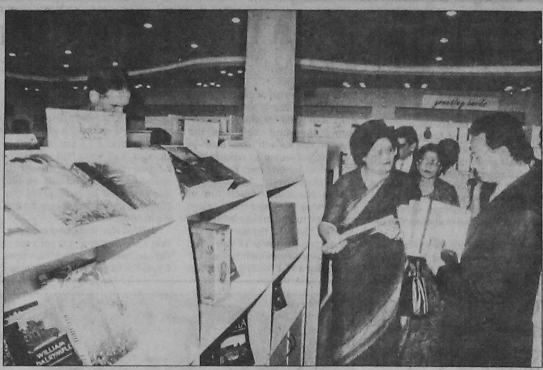
Commerce Minister Amir Khasru Mahmud Chowdhury flips through a book after inaugurating the first retail outlet of Etcetera Bangladesh, a bookstore, at Gulshan yesterday. The store has also a number of other departments - a stationery section, a greeting card and gift section, a children's section and an Italian Café.

The Abritri Academy and the Salimullah Hall Theatre will jointly organise a cultural function and stage a drama on the Liberation War at the TSC Sharak Dweep at 5.30pm on December 7.