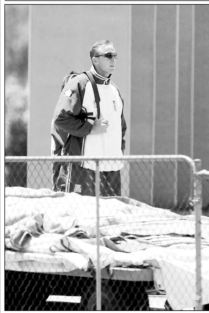
South Africa fast bowler Allan Donald watches the Test between Australia and New Zealand at the WACA Ground in Perth on Monday.