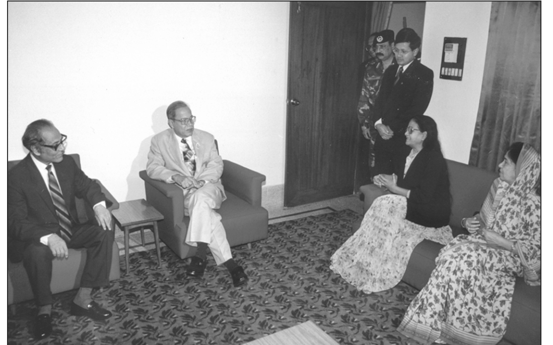
President Badruddoza Chowdhury yesterday made a courtesy call on former president Shahabuddin Ahmed at the latter's Lalmatia residence in the city yesterday.

Meanwhile, illegal toll collection from vehicles at almost all entry points to the city by a section of traffic police personnel is going on unabated. This evil practice greatly increases before the Eids.