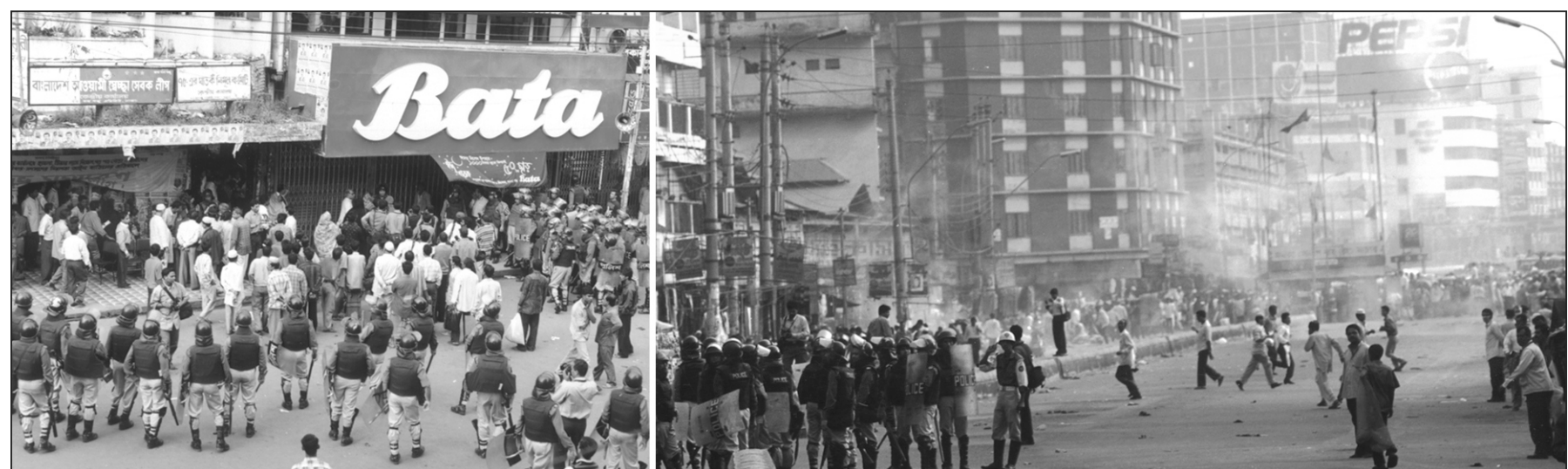
Police yesterday did not allow opposition Awami League to hold a protest rally. Photos show police cordon the party's central office at Bangabandhu Avenue yesterday. They also dispersed the activists when they tried to stage rally there.