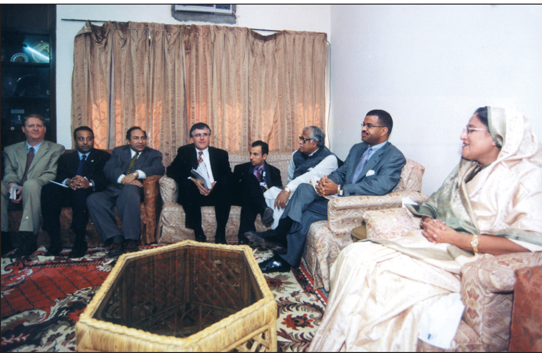
A delegation of US-Bangladesh Business Council met former PM and Opposition Leader Sheikh Hasina at her Dhanmondi residence yesterday.