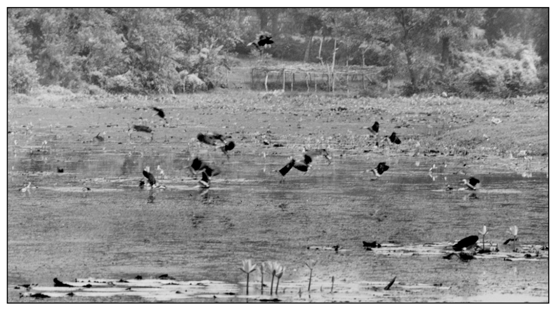
Hundreds of bird lovers thronged the lakeside of the Jahangirnagar University campus to watch birds at the daylong Bird Fair

presented an event of general knowledge quiz on bird that was too taken part by a large number of