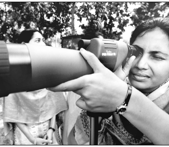
A bird-lover adjusts the focus of a telescope at the Bird Fair held at the Jahangirnagar University campus

2001-2002 was too, inaugurated from the same venue at the end of the bird fair at 4 pm