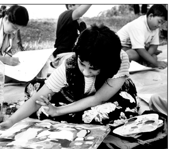
Children are busy painting their favourite birds at a competition organised in

ing display by Kalidas Karmakar at the same venue enhanced the importance of the daylong affair. The photo exhibition 'Poyomonto pakhi' (Bird of good omen) revealed the message of Enam that birds are a strong indicator of the quality of natural environment. When one has found a large number of birds overhead it would then simply be a sign of good omen, hence, a proof revealing the superior quality of the aerial environment around. Colour photographs of various shore and jungle specimens repeatedly drew