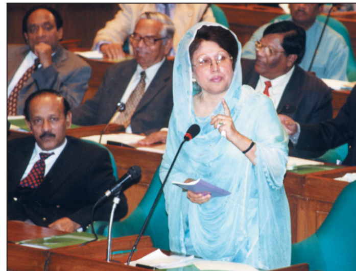
Prime Minister Khaleda Zia addressing the concluding sitting of the first session of Eighth Jatiya Sangsad yesterday.