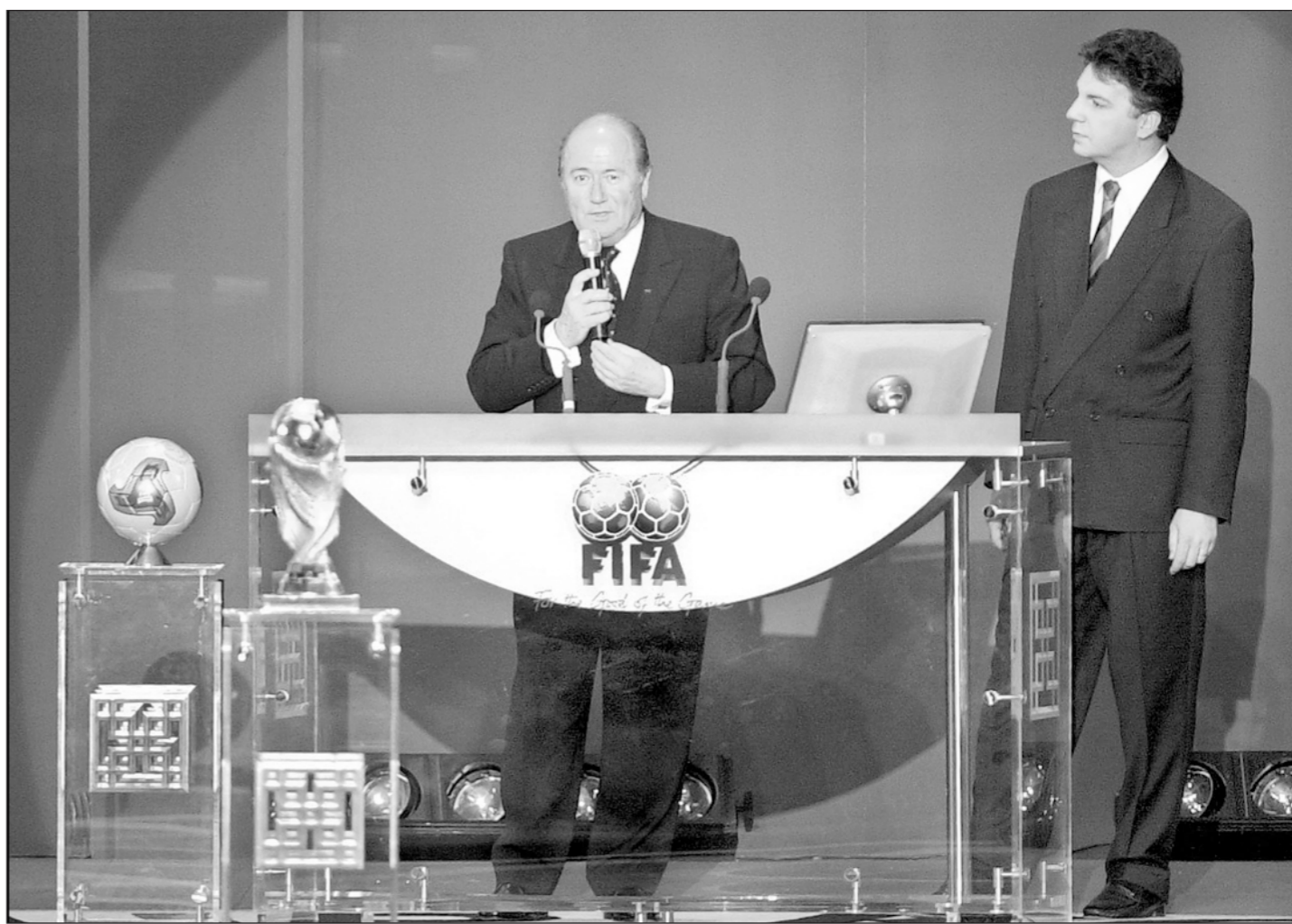
President of the International Football Federation (FIFA) Sepp Blatter speaks during the draw ceremony of the World Cup 2002 while FIFA general secretary Michel Zen-Ruffinen looks on at the Pusan Exhibition and Convention Centre in South Korea on Saturday.