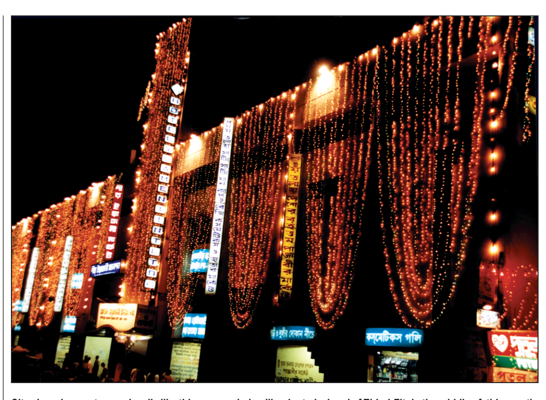
City shopping centres and malls like this one are being illuminated ahead of Eid-ul-Fitr in the middle of this month. The photo was taken from Gulistan area last night.

of The Independent. He had long been involved in journalists' union. He is former president and secretary general of Bangladesh Federal Union of Journalists (BFUJ) and general secretary of Dhaka Union of Journalists (DUJ)