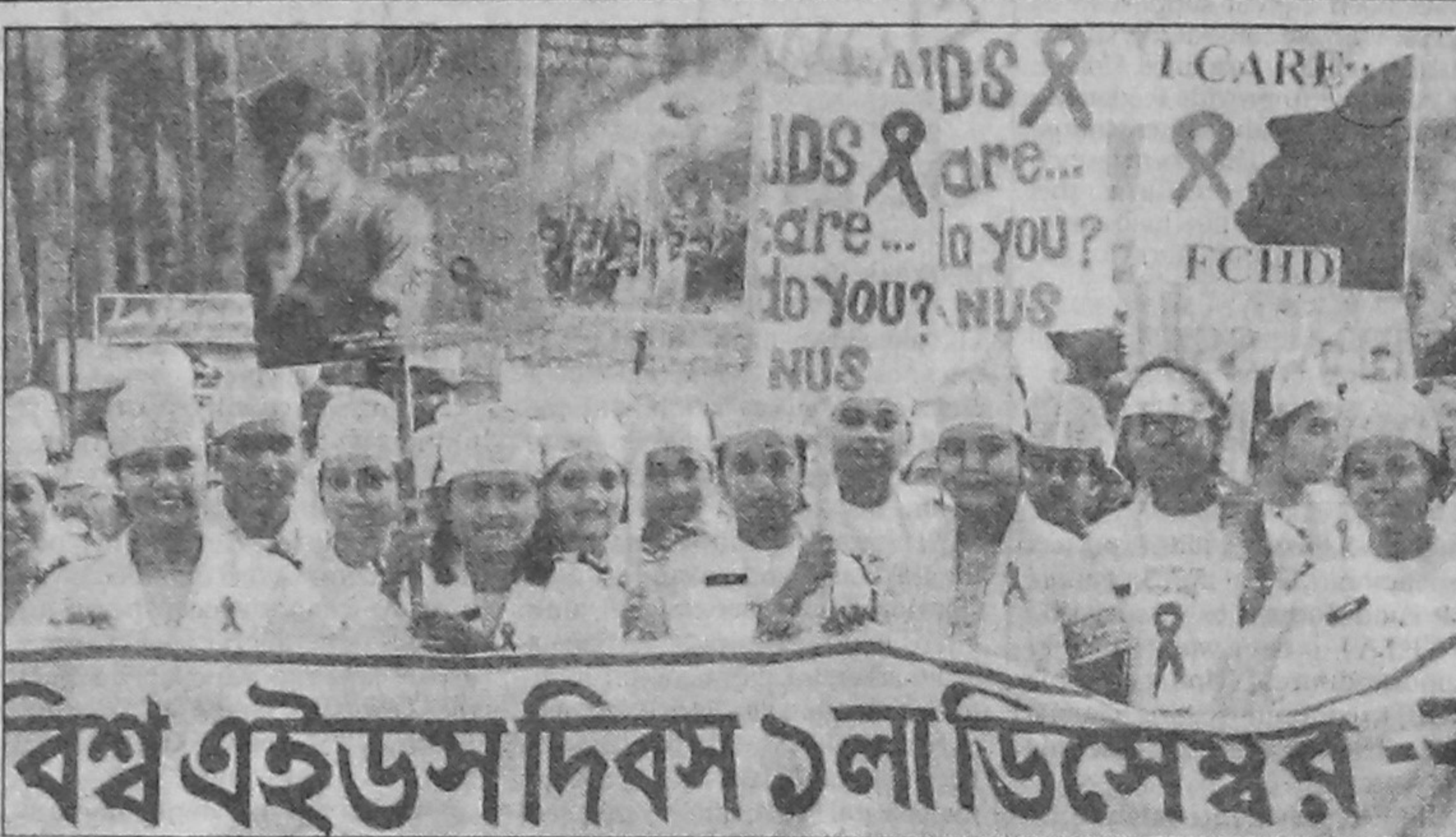
Health Directorate and UNDP brought out a colourful procession in the city yesterday to mark the World AIDS Day.

They called upon all pro-liberation and democratic forces to resist all conspiracies against Bangabandhu and the history of Liberation War.