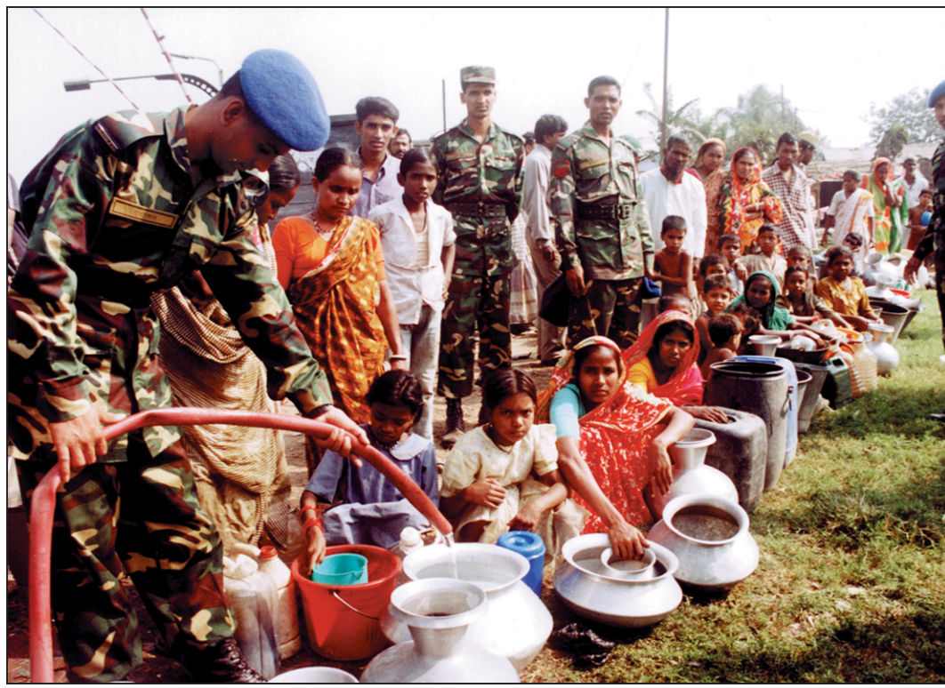
Army personnel have been engaged to help distribute water at different places of the city hit by scarcity of drinking water. The picture shows an army man distributing water among the residents of Kamalapur area yesterday.

Former prime minister and Leader of the Opposition in the Parliament Sheikh Hasina has called upon the people to be united sinking all differences for building a prosperous nation. In a message on the occasion of fourth anniversary of peace accord on Chittagong Hill Tracts (CHT), she said the accord signed on this day in 1997, ushered in a glorious chapter in our national history. "It is the time to make all out efforts for development of our nation by putting aside all ethnic conflicts," Sheikh Hasina said while greeting the nation on the occasion. She said that the past misdeeds and violation of basic human rights by dictators in the country had resulted in blood shed and warlike situation in the hill areas for the last two decades. The people of the area were thus pushed towards hunger, poverty, ignorance and illiteracy, she added. The CHT peace accord had opened scope for peace, stability and development of the region and the country, she observed. Sheikh Hasina however alleged SEE PAGE 11 COL 8