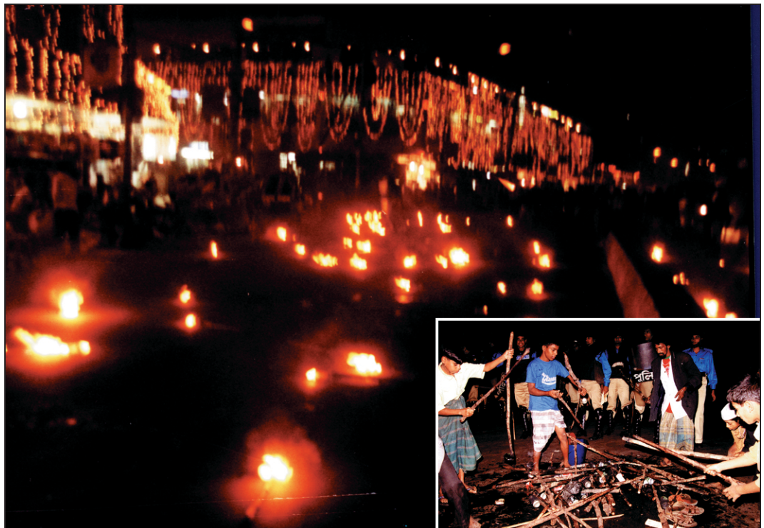
Torches lie scattered on Bangabandhu Avenue in the city yesterday after police swooped on a procession of Awami League in support of today's hartal. The picture (inset) also shows police collecting torch sticks, left behind by AL activists, with the help of unidentified boys.

Main opposition Awami League enforces an eight-hour hartal in the capital city today protesting the government move for repeal of a special law providing state security for former prime minister Sheikh Hasina and 'acts of repression' on the AL activists and the Hindus. The AL termed the government move to scrap the Father of the Nation's Family Members Security Act, 2001 part of a conspiracy to kill Sheikh Hasina and her sister Sheikh Rehana, two surviving daughters of Bangabandhu Sheikh Mujibur Rahman. The Act provided lifelong security coverage to Hasina and Rehana under the Special Security Force (SSF) Ordinance. The parliament is scheduled to pass a bill seeking repeal of the Act today. The BNP-led coalition government moved the bill on the 48th day of its tenure, prompting the opposition to go for street agitation. Meanwhile, police clubbed and tear-gassed leaders and activists at an AL torch procession at Bangabandhu Avenue in the city yesterday evening brought out to drum up support for the 6:00am-2:00pm shutdown, according to witness. At least a dozen AL supporters were wounded during the police action, claimed senior AL leaders. SEE PAGE 11 COL 3