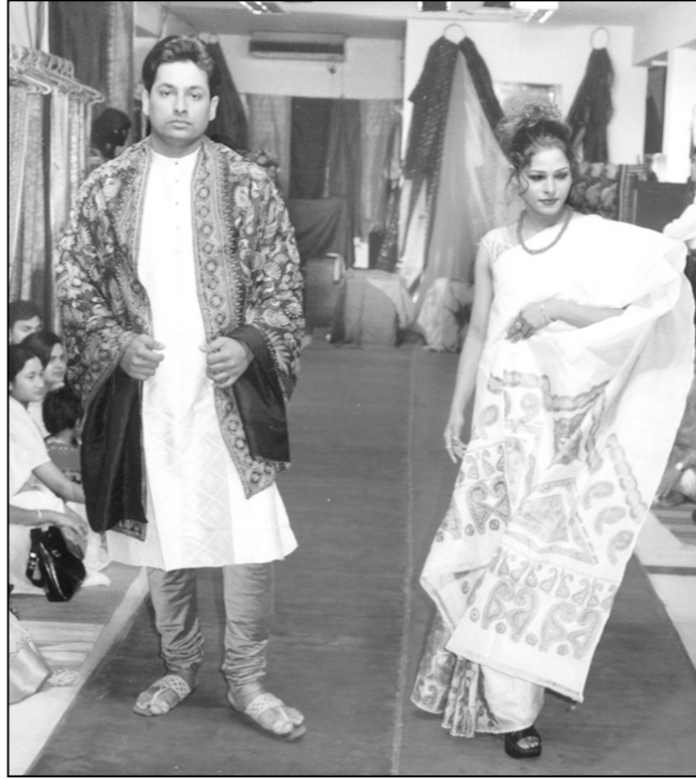
An embroidered shawl for men and block print on an off-white saree

Some elegant, well-tailored and artistic design salwar kameez sets was next. This exclusive collection included a