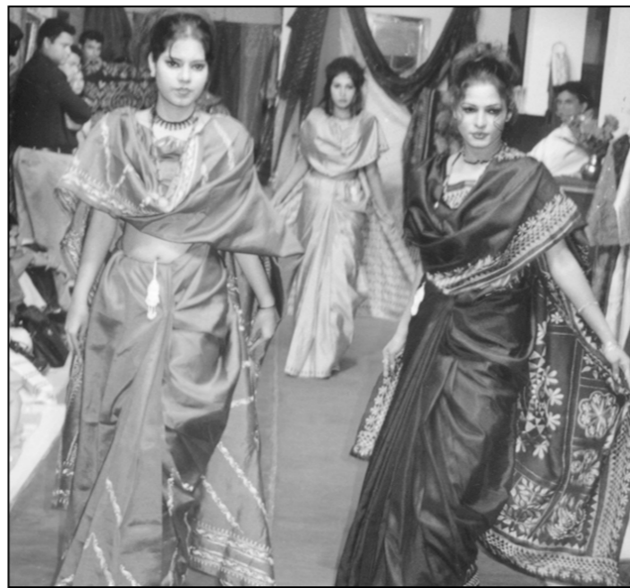
Models showcasing silk sarees in brown and deep green

deep green salwar kameez having golden works on it, a pink having same coloured works on the body and a black kameez having brown works on it.