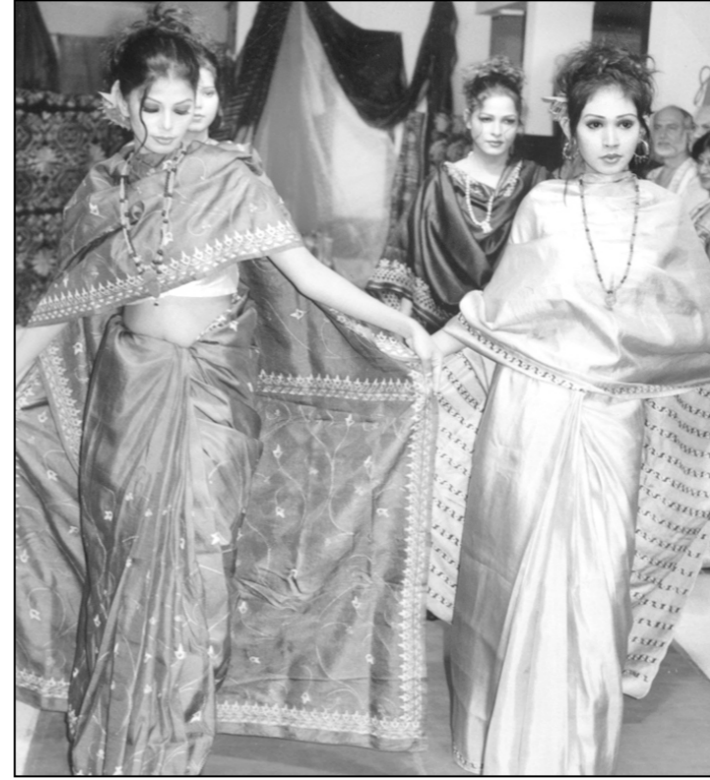
Two exclusive silk sarees in ash and beige with embroidery