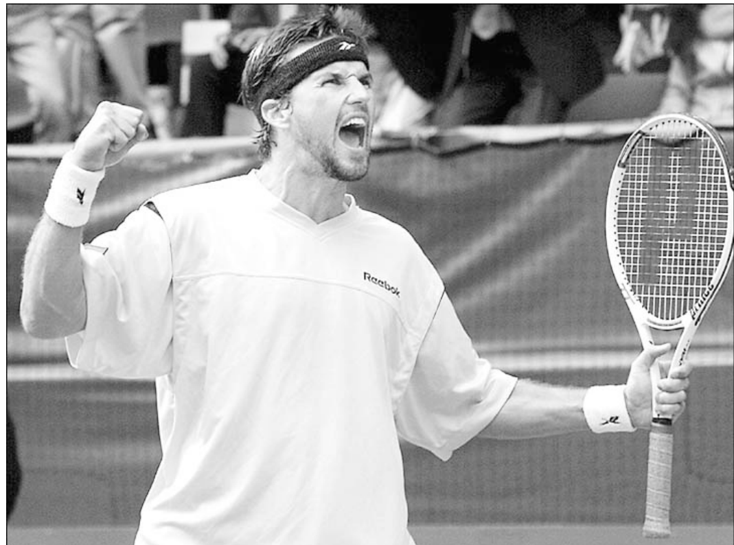
Australian Patrick Rafter is jubilant after beating Sebastien Grosjean of France in the second rubber of the Davis Cup final in Melbourne yesterday.

Mother of all FROM PAGE 13 ensuring it is as open and pure as possible. This means that countries which met in the qualifying competition could also meet again in the finals -- pitting perhaps England and Germany together again, or Portugal, Russia and Slovenia and Turkey and Sweden.