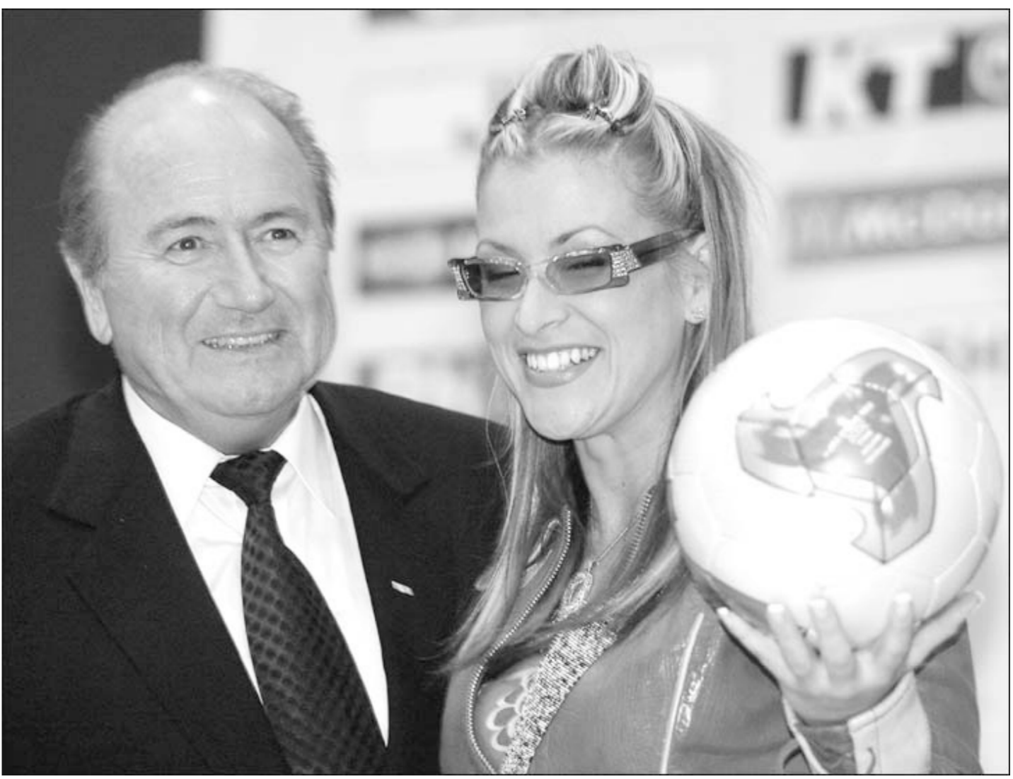
FIFA president Sepp Blatter and US singer Anastacia, holding an official World Cup ball, pose for a photograph during a press conference at the Media Centre in Pusan on November 30.

Sunday (all matches at 1630 GMT): Hertha Berlin v Bayern Munich, SV Hamburg v St. Pauli.