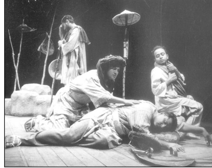
Catastrophic final scene shows Rustam appalled by death of his son Sohrab at his own hand