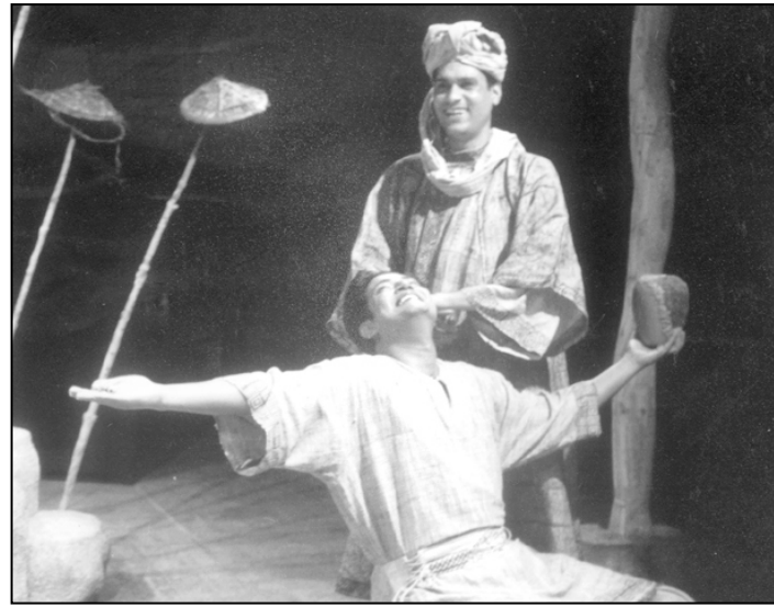
Rustam and emperor Kaykows at a light moment when they mutually agree upon a point

greed and frenzy. In course of their journey these pilgrims of life try to remain faithful to this cause of humanity.