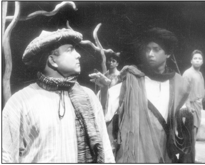
Emperor Afrosia, prior to a battle against Iran, briefs Sohrab who is a war hero of Turan

Tahmina gives birth to a son in his absence who later becomes Sohrab—the saviour of Turan from foreign attacks. He emerges as a befitting match for unbeaten Iranian war hero. With an intense desire to encounter his noted father in the battlefield, Sohrab leads a fight launched against Iran. In the battle field, son and father get locked in a deadly duel, unaware of each other's identity. The two emperors of Iran and Turan conceal the identity of Rustam from Sohrab to serve their respective evil ends of staying in power at any cost. Thus the father kills the son in the battlefield, a result caused