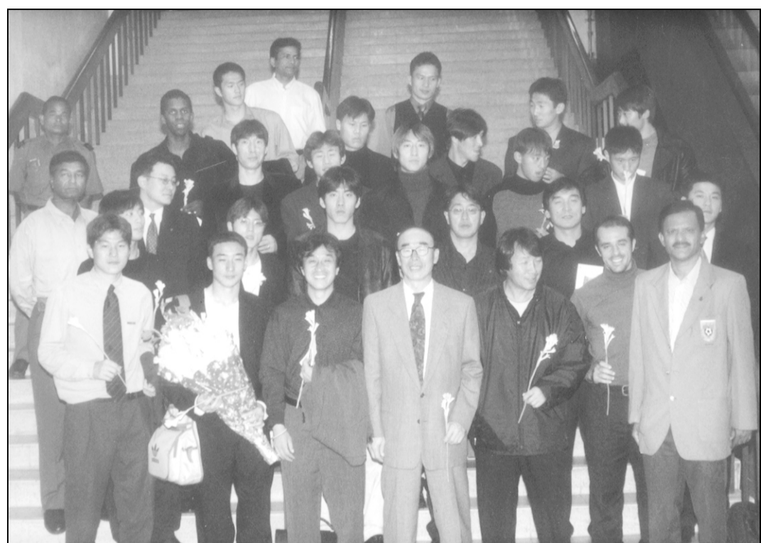
Players and officials of the Anyang soccer team at the Zia International Airport Monday night.

But more importantly cricket follower of the country will eagerly want to see if Asghar can prevent politics from dictating cricketing affairs.