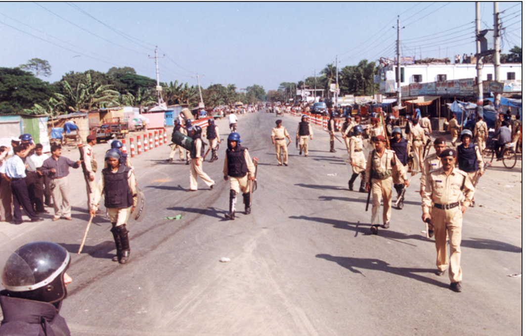
highway to a stop yesterday.

Police and witnesses said the clash between the student fronts of BNP and Jamaat-e-Islami erupted at noon after a group of JCD activists attacked