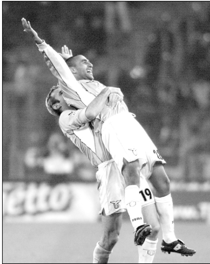
Lazio's Fabio Liverani (R) is over the moon after scoring against Juventus while team-mate Giuseppe Favalli lifts him at Rome on November 24.