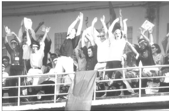
Of course it wasn't to be the same for the visitors as for the home side, Zimbabwe still had some support at the Bangabandhu National Stadium during the second one-day international against Bangladesh on Sunday.