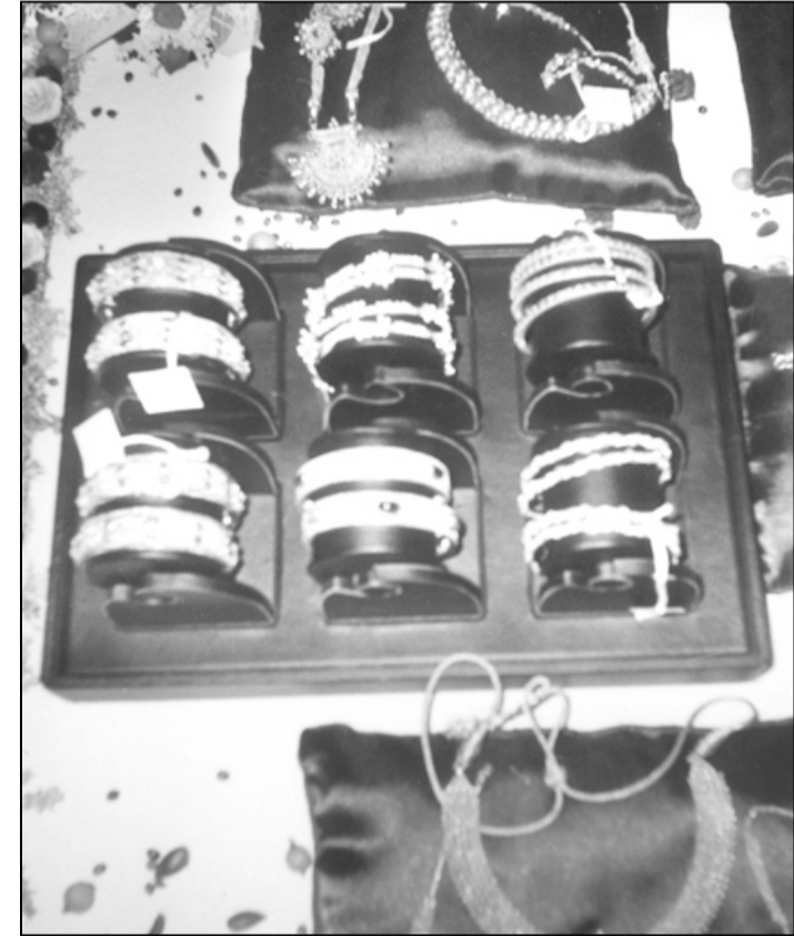
Gold bangles and necklaces with diamond are major attraction of the show

The exhibition remains open from 10 am till its closure at 8 pm this evening.