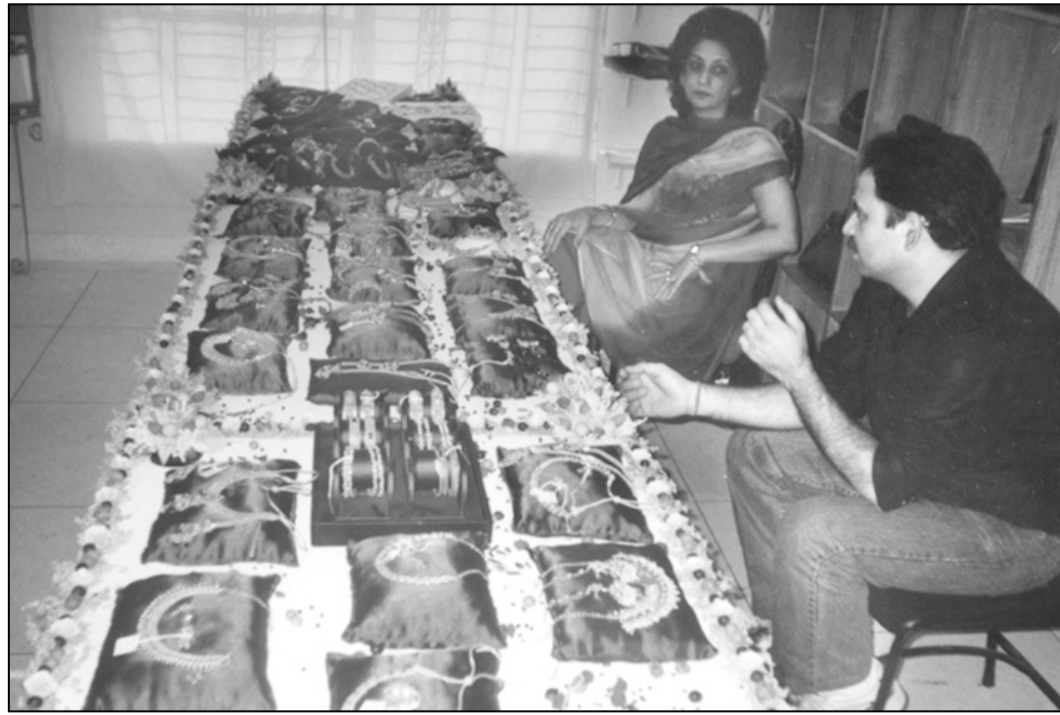
Nicely decorated table displays the exhibits

It has almost turned a custom for Kaaya to hold overseas