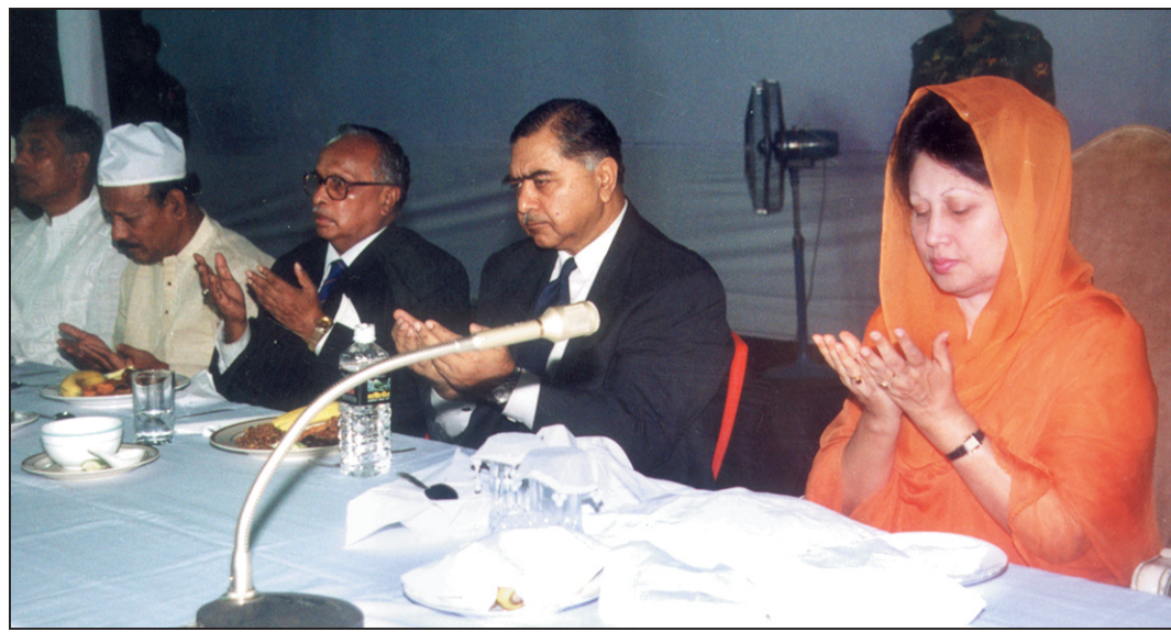
Prime Minister Khaleda Zia seen offering Munajat at an iftar party hosted for political leaders and MPs at the Pradhanmantri Bhaban yesterday.