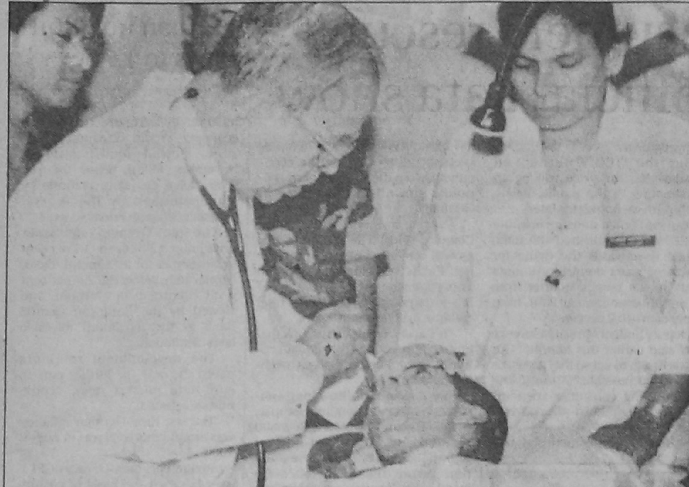
Beyond the boundary: President Prof AQM Badruddoza Chowdhury did not stay clear of his profession as a physician and decided to see patients free at the Bangabhaban on Thursdays. Photo shows Prof Badruddoza examining a Bangabhaban staff on Thursday.