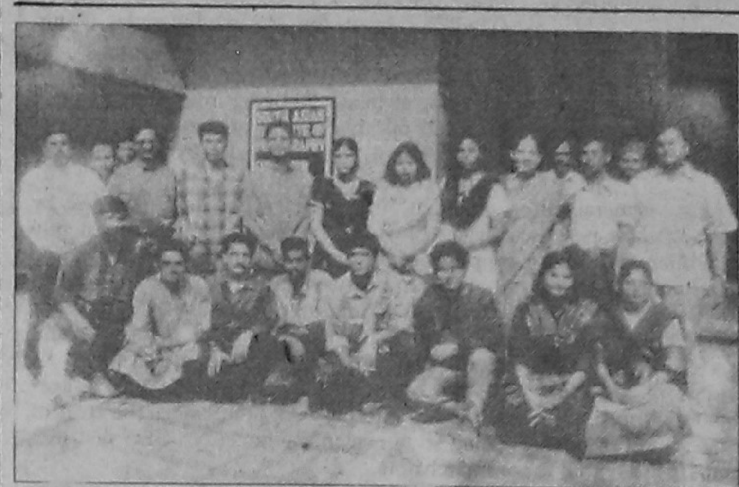
Participants of a workshop titled 'Promoting Human Rights Practices Through Internet' that began on the Pathshala premises in the city yesterday. Pathshala - South Asian Institute of Photography in collaboration with the British Council organised the two-day workshop.

Home Minister Altaf Hossain Chowdhury yesterday sought cooperation of all sections of society in improving the law and order situation in the country. "All the election pledges made by Prime Minister Khaleda Zia are being implemented in phases," Chowdhury said while addressing a reception in the auditorium of Dumki Science and Engineering University. Teachers, students and employees of the university attended the function.