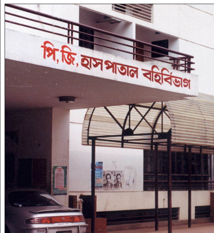
'PG Hospital Outpatient Department' was written at an entrance to BSMMU on Thursday although the previous status of the hospital is yet to be restored.