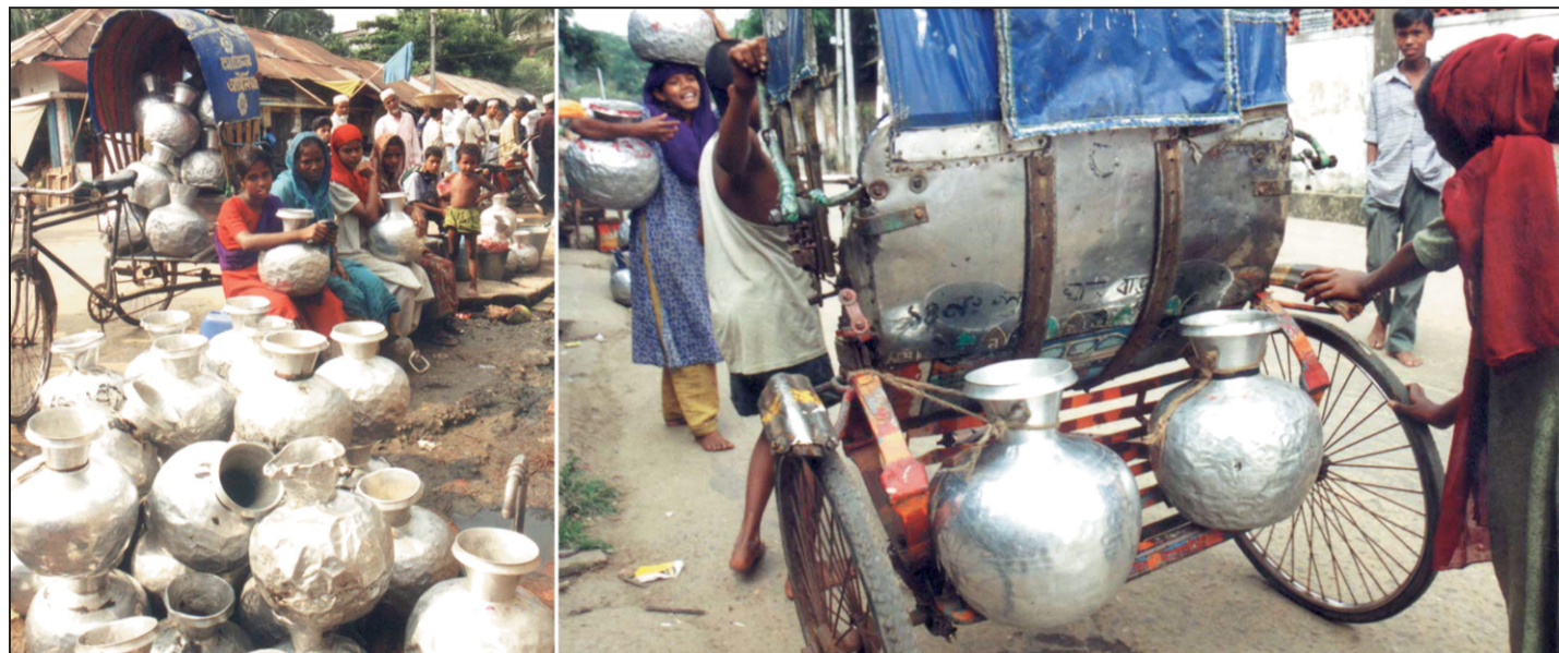
Acute water crisis has gripped many areas of Chittagong city. The above pictures were taken from Lalkhan area yesterday. The other worst-hit areas are Halishar, Patenga, Mansurabad and Anderkilla. Chittagong WASA supplies only one-third of the total requirement of about 100 m gallons a day for the 3m people of the port city.