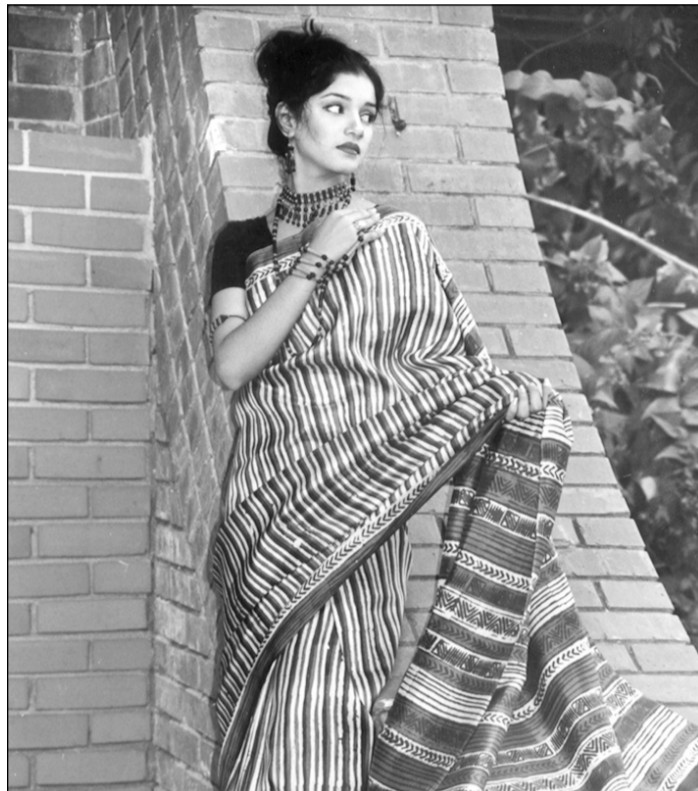
A model displays an exquisite sari brighten with indigo ultramarine

Arun Naha enlightened the media persons by giving a