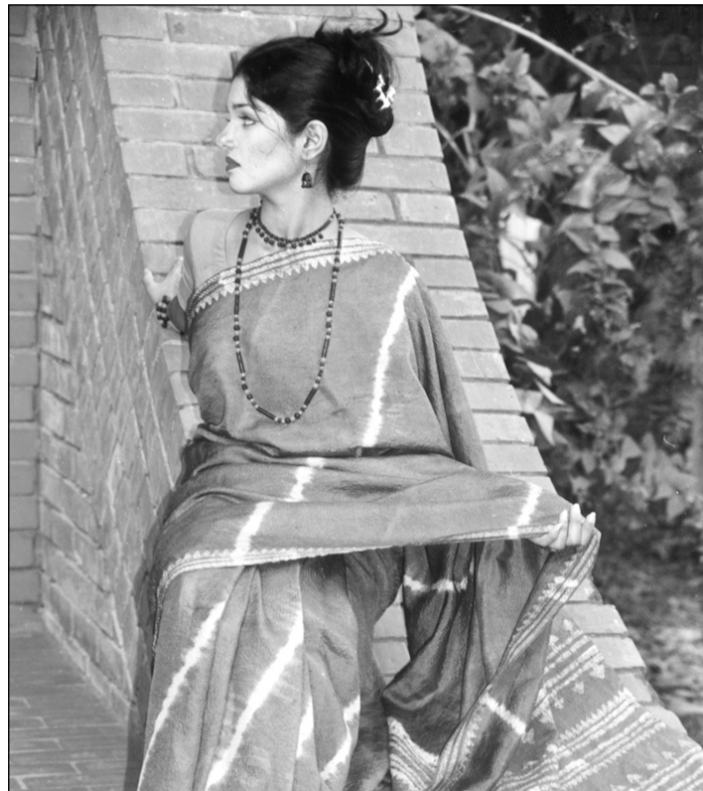
Strips wear a new look with the touch of indigo

The materials used in indigo collection at the show are Tasar silk, soft silk, linen, khaddar, fine