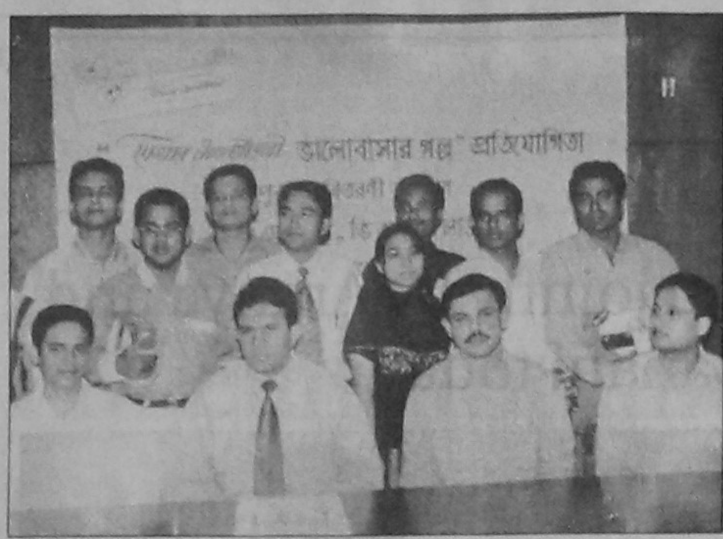
The winners of 'Fair and Lovely Love Story' competition with the guests at the prize giving ceremony held at the National Press Club on November 20.

A total of 1,371 people including four listed terrorists, were also arrested from across the country during the drive in the last 24 hours ending at 6 am yesterday.