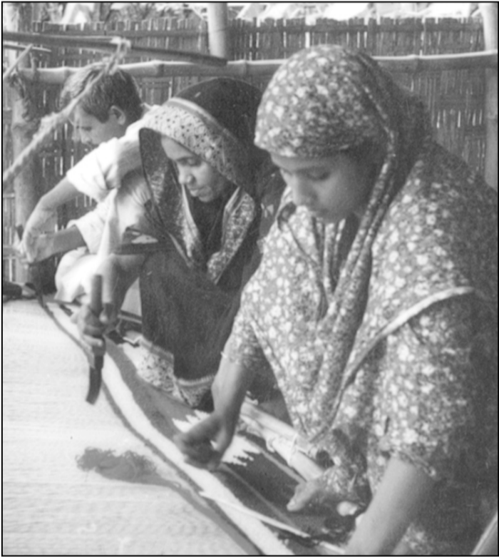
Artisans engaged in weaving satranji at the village Nishbetganj