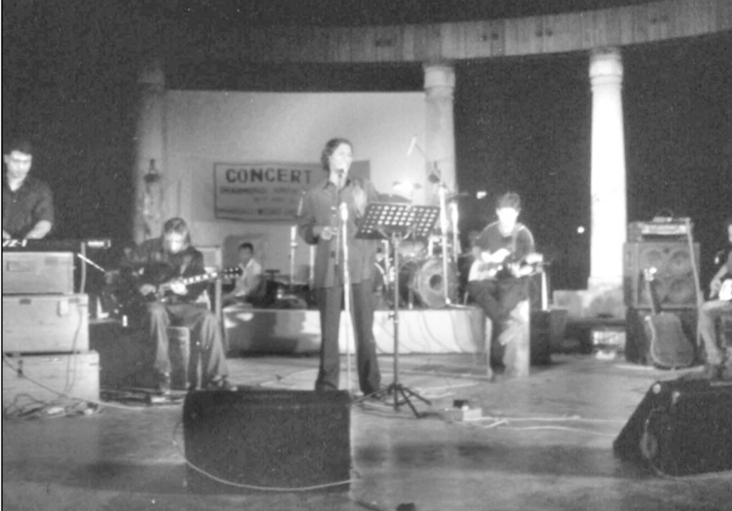
Wizard Showbiz performs to a captive audience at the inaugural show of the newly constructed amphitheatre at Dhanmondi

Dhanmondi amphitheatre opens with Wizard Showbiz's concert