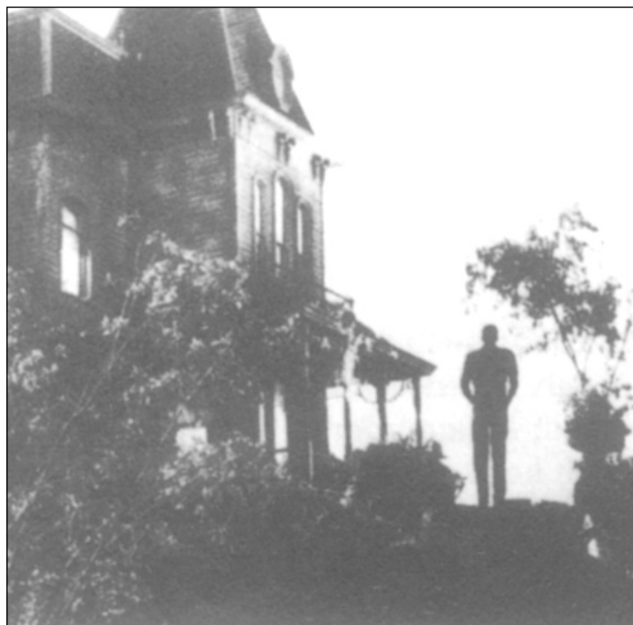
A scene from Psycho

Blackmail (1929) was the first British feature film with synchronous sound; and already showed the characteristic interplay of sound-track and editing that distinguishes his work throughout his career.