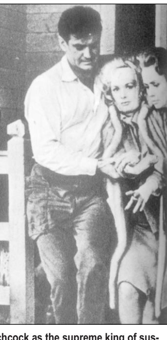
The Birds, a film that established Hitchcock as the supreme king of suspense thriller

Blackmail (1929) was the first British feature film with synchronous sound; and already showed the characteristic interplay of sound-track and editing that distinguishes his work throughout his career.