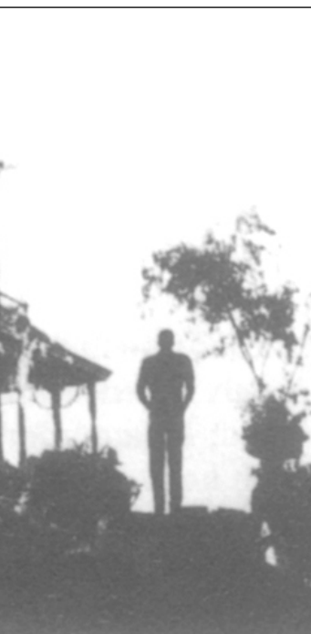
The Birds, a film that established Hitchcock as the supreme king of suspense thriller

Blackmail (1929) was the first British feature film with synchronous sound; and already showed the characteristic interplay of sound-track and editing that distinguishes his work throughout his career.