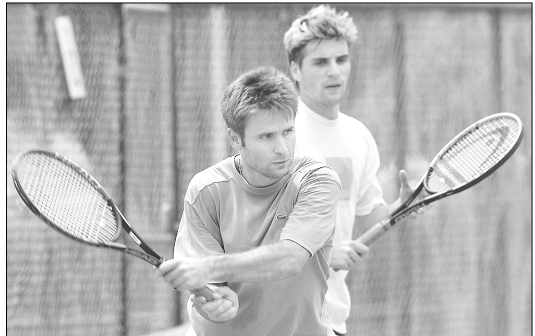
Frenchmen Fabrice Santoro (L) and Arnaud Clemente practise in Melbourne yesterday.

Murad of Bangladesh captured three wickets conceding 44 runs in 9 overs, Shafaqe bagged two for 26 runs in 8 overs while Waseluddin and Shaiful got one wicket each for 18 and 20 runs respectively.