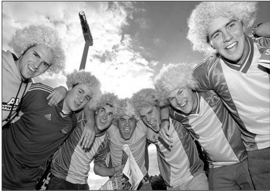
AUSSIE ALL THE WAY: Fans show the colours of Australia before the match against Uruguay at Melbourne yesterday.