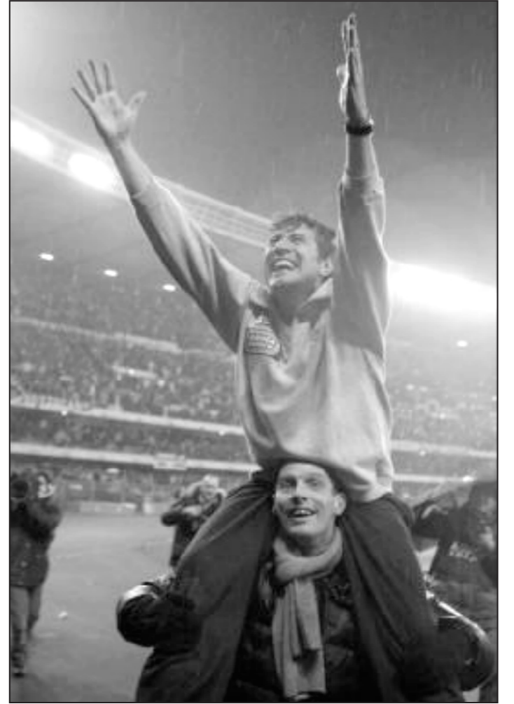
Verona's coach Alberto Malesani (top) rides on the shoulders of a supporter as he celebrates at the end of the Serie A match against Chievo on November 18.