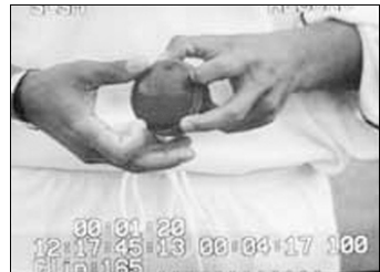
These video grabs spoke against Tendulkar.