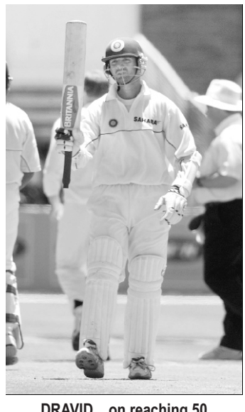
DRAVID... on reaching 50