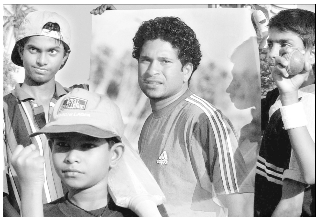
WE ARE BEHIND YOU: Young Indians hold a poster of Sachin Tendulkar as a posture of their support in Bombay yesterday. The batting maestro was on Tuesday sanctioned by ICC match referee Mike Denness for an alleged ball tampering.

Madpur Krira Chakra will take on Ambagan Krira Chakra today at the same venue.