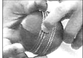
changing the state of the ball, was fined for breaking the rules by rubbing dirt from his pocket on to the ball.