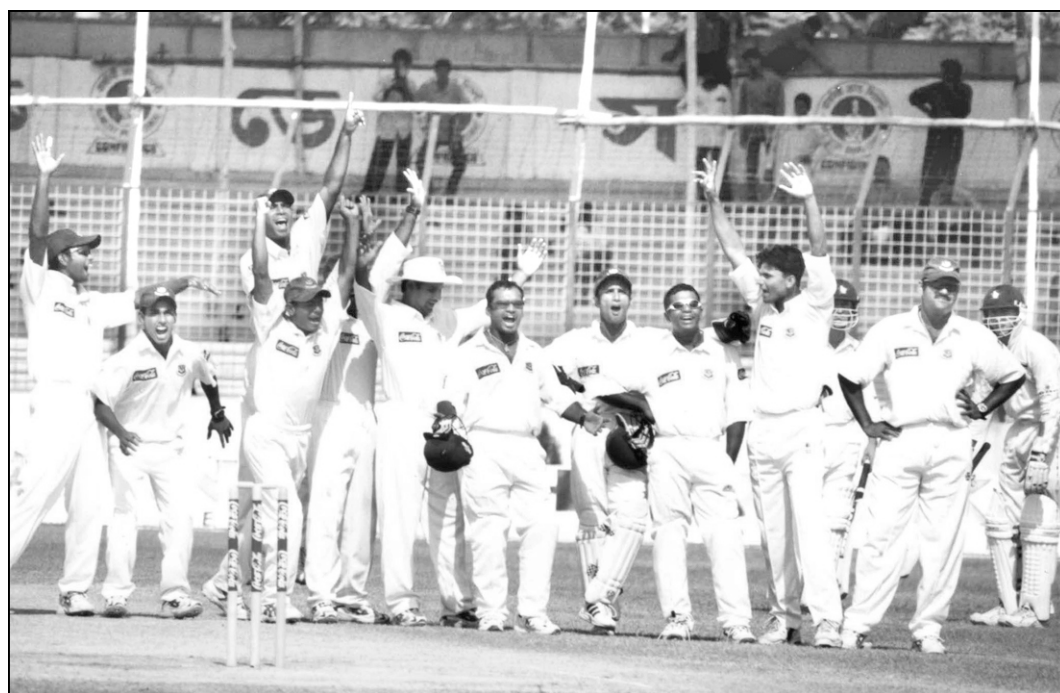
SOME JOY FOR THE HOME SIDE: Bangladesh players celebrate the dismissal of Zimbabwe captain Stuart Carlisle on the fifth and final day of the Chittagong Test yesterday.

"I think a lot of credit should go to Bangladesh. They fought very hard." Asked whether he thought the win would come so easy on the final