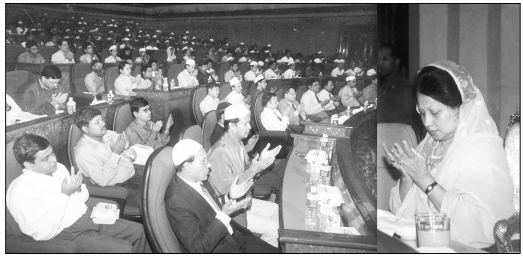
Prime Minister Khaleda Zia held an iftar party for officials and employees of her office at the International Conference Centre (ICC) yesterday evening.