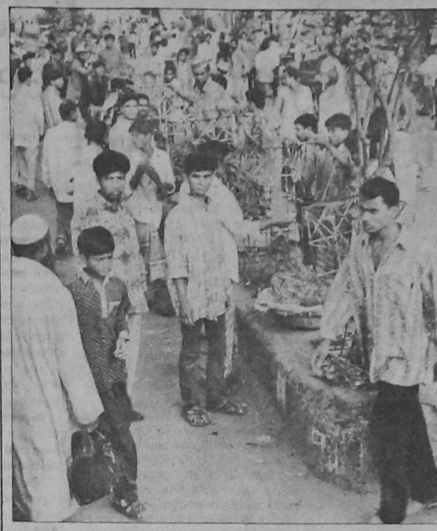
Hawkers have eventually closed in on road-dividers in the city, as sidewalks are already occupied by others.

Friends, relatives, political colleagues and admirers have been requested to attend the qulqhwani and pray for salvation of the departed soul.