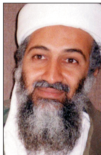
Osama bin Laden

A defence official told The Sunday Telegraph that "some very hot" intelligence had been gathered that could lead to bin Laden's