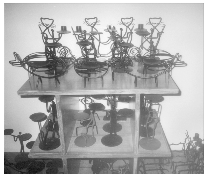
Fine wrought iron decoration pieces to enrich collections of Mayasir

items of Mayasir can be obtained within a price range of 15/- and 200/-.