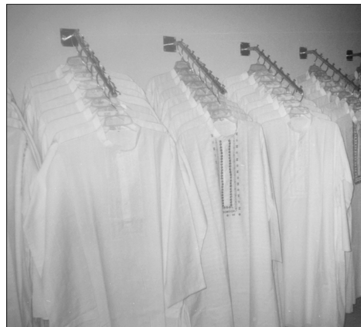
Exclusively designed Punjabis at Mayasir would surely be a crowd-pulling item

MAYASIR, a Persian term for the word 'opulent' is about to become a regular utterance to the select shoppers of Dhaka!