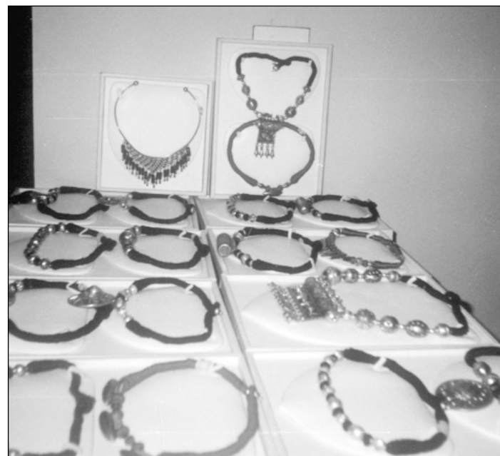
Exotic silver jewellery is a big attraction of the new outlet

One of the last items to mention is the exotic jewellery items of Mayasir!