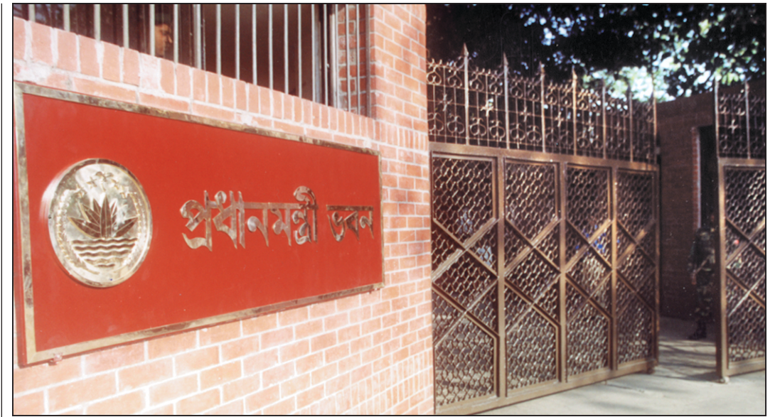
A new plaque with the words Prodhanmontri Bhaban (Prime Minister's House) inscribed in it has been placed on the wall by the main entrance of erstwhile Ganobhaban.