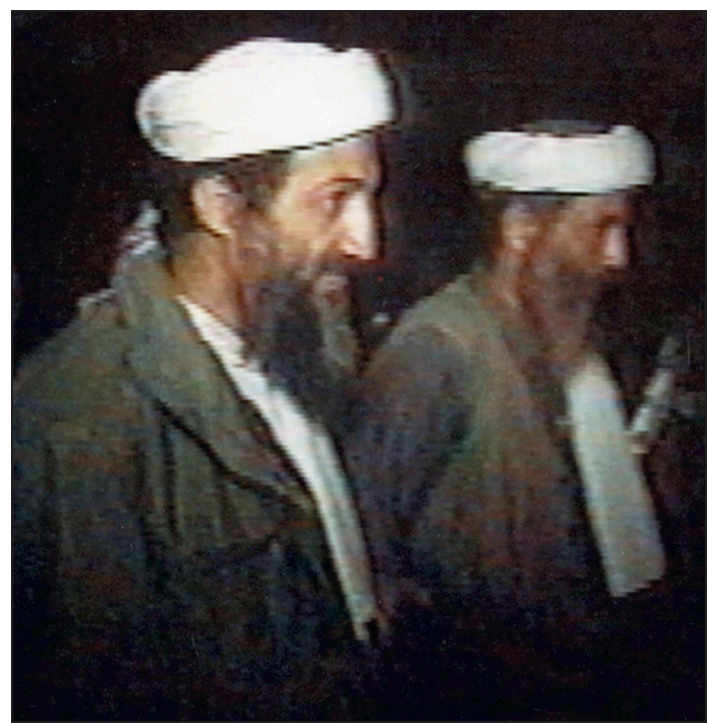
This undated file video grab shows Osama Bin Laden (L) and his deputy Mohammad Atef (R) walking together at an unspecified location in Afghanistan. US intelligence intercepts indicate that Atef, bin Laden's deputy and top military commander, was killed in an air strike near Kabul in what would be a major blow to the al-Qaida terrorist network, US officials said on Friday.

Armed cadres of JCD were found moving on the campus yesterday.