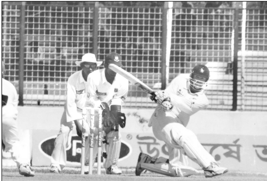
Zimbabwe superstar Andy Flower executes a forceful sweep shot on the second day of the Coca-Cola second Test at the MA Aziz Stadium on Thursday. Flower scored an unbeaten 114.