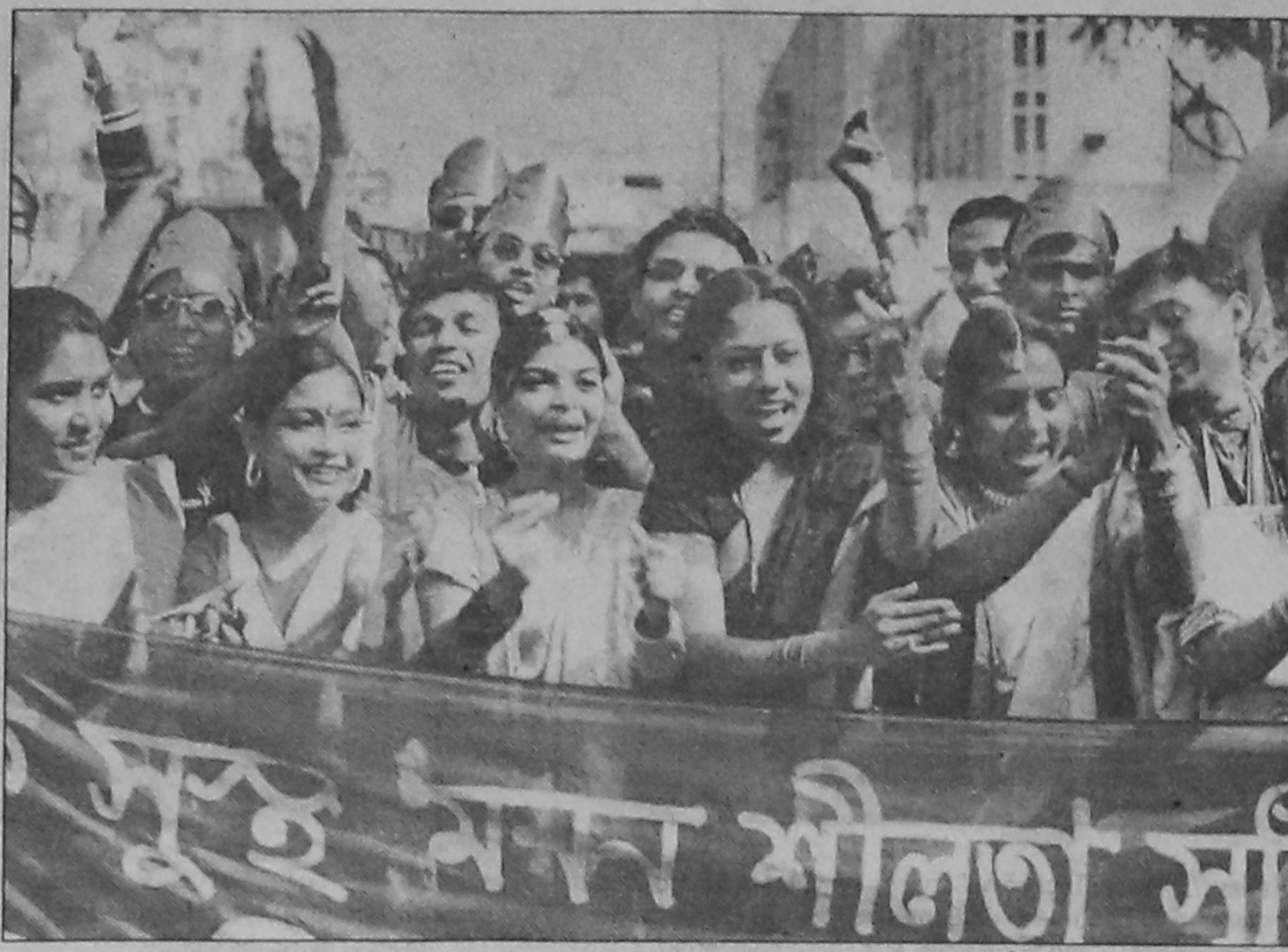
The Bangladesh Theatre brought out a procession in the city yesterday on the occasion of its 15th founding anniversary.