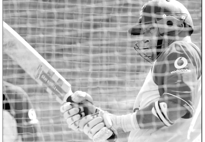
England captain Nasser Hussain practises in the nets at the Wankhede Stadium in Bombay yesterday.

The second Test will be played in Ahmedabad from December 11 and the third in Bangalore from December 19.