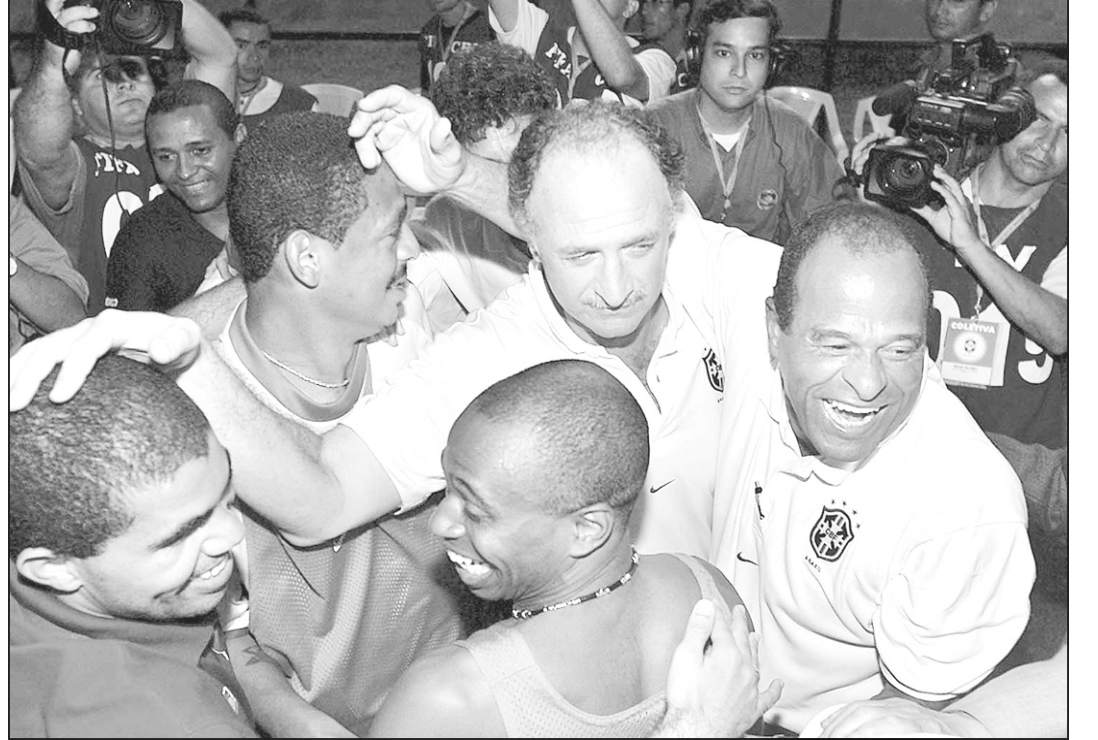
RELIEF, THY NAME IS SCOLARI! Brazil coach Luis Felipe Scolari (C) is surrounded by ecstatic players and staff members after the resounding victory over Venezuela on November 14.