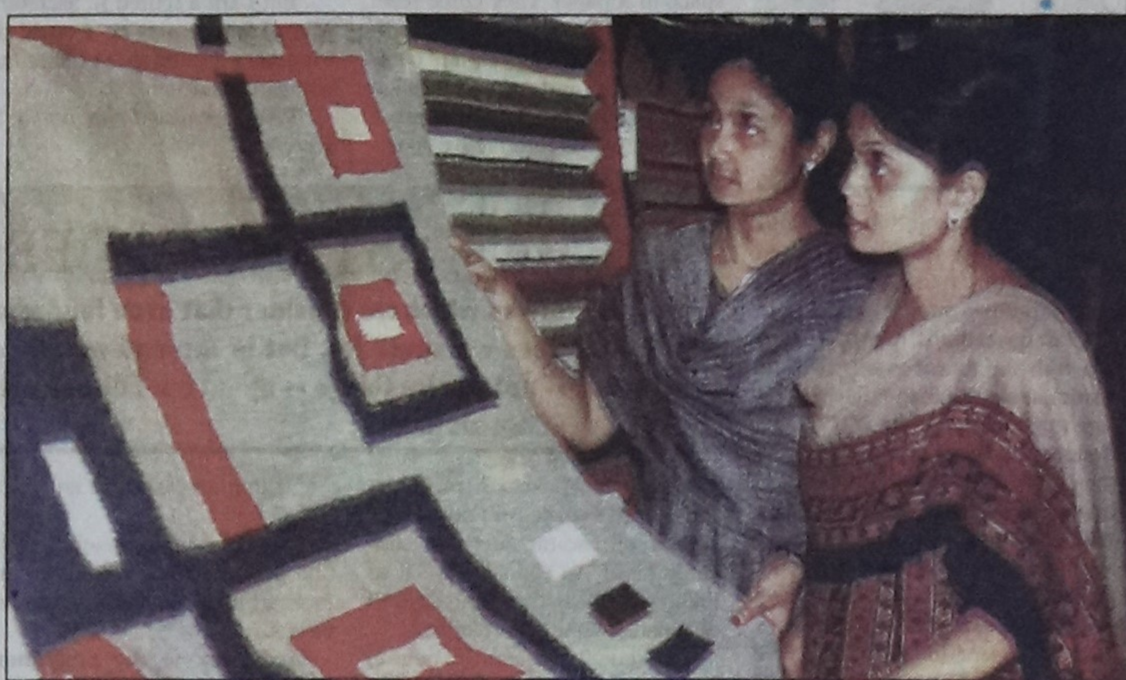
Visitors admire a Sattranj , a product from Nishbetganj, Rangpur, at an exhibition at the Drik Gallery in the city yesterday. The exhibition will continue till November 17.

Population in Bangladesh now (in mid 2001) reached 140.4 million and it is expected to grow to 265.4 million by 2050, the report said.