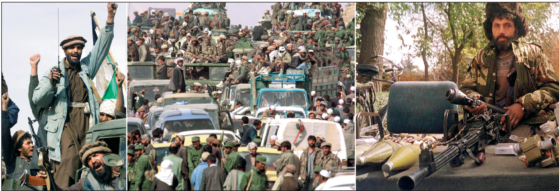
Northern Alliance soldiers shout "Allahu Akbar" and salute as they drive into Kabul after capturing the Afghan capital yesterday. Thousands of refugees from the Afghan capital and troops wait for permission (centre) to enter the northern outskirts of the city and an Afghan soldier of the Northern Alliance guards the gate of the foreign ministry office after the fall of the Taliban.