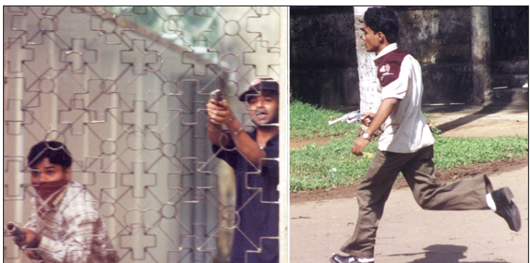
A young man, carrying a revolver, chases his rivals at Jagannath Hall while two others aim their weapons from their positions at Zahurul Haq Hall as gunshots rocked the Dhaka University yesterday.