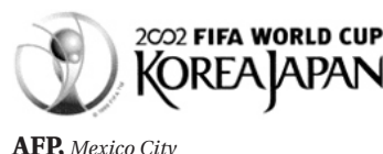
Mexico City

Mexico on Sunday booked their ticket to the World Cup finals in Japan and South Korea next June with a 3-0 win over Honduras at the Aztec Stadium in their final qualifier.