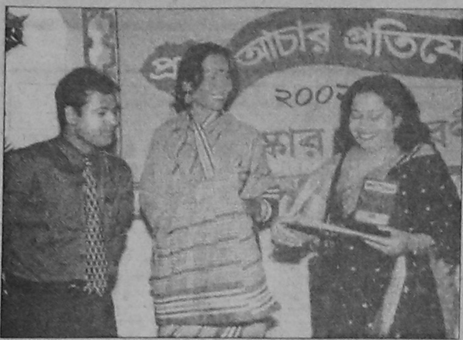
PRAN Pickle Competition Prize Giving ceremony was held at Dhaka Ladies Club recently. International fashion designer and special Envoy of UNESCO Bibi Russel handed over the crest to the winners as chief guest.