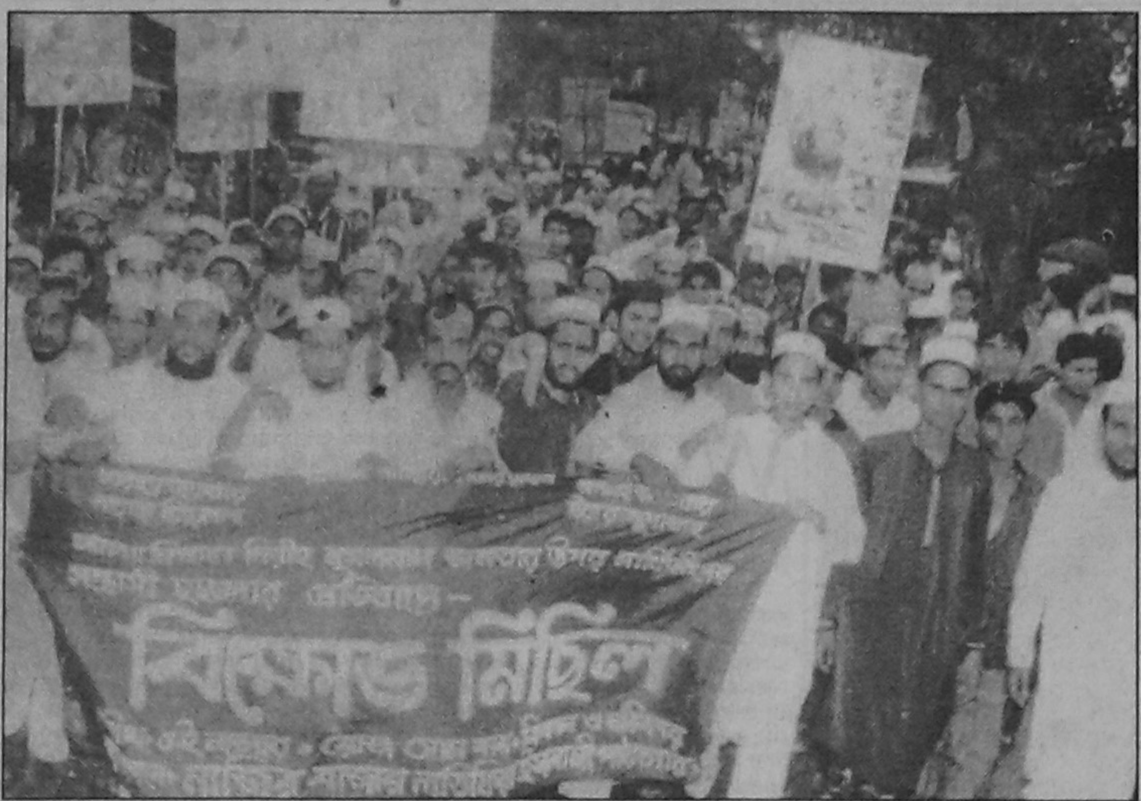
Demonstrators parade the streets of Sylhet town in a procession on Monday afternoon protesting the US-led airstrikes in Afghanistan.

BSS, Munshiganj A three-day long training course on improved methods of sugarcane cultivation concluded in Narsingdi on Thursday. Held at the Crops Research Sub-Centre at Manikpur, the training course was organised by the Department of Agriculture Extension (DAE) to impart technical knowledge to sugarcane growers on proper methods of planting sugarcane, application of fertilisers, irrigation and use of insecticides. Thirty sugarcane growers from different areas of Munshiganj took part in the training course. On the concluding day, the deputy director of DAE, Munshiganj distributed certificates among the trainees.