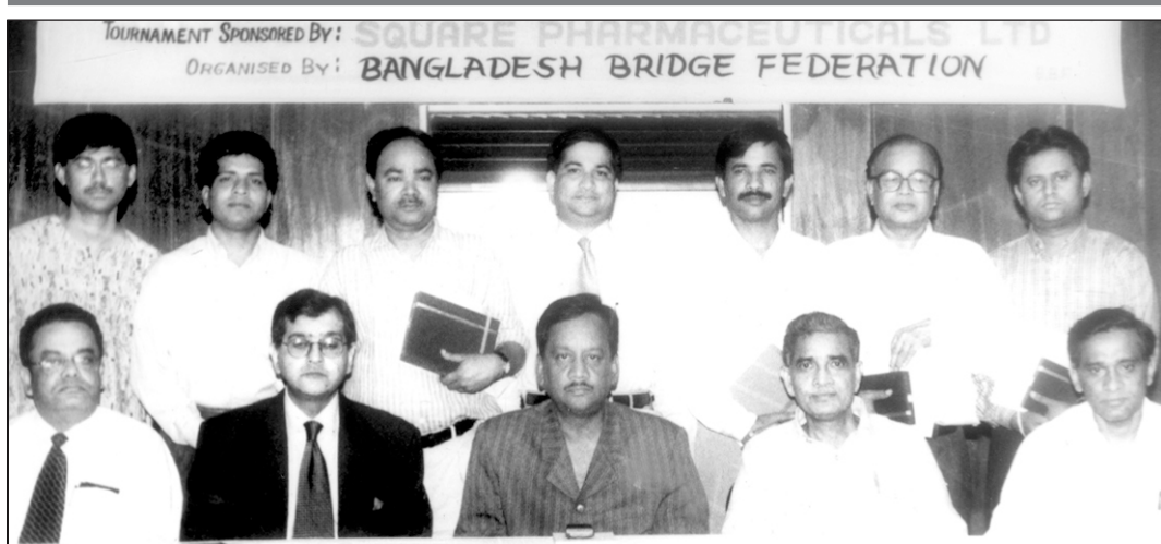
Winners of the National Pairs Bridge Championship are seen with State Minister for Youth and Sports Fazlur Rahman (sitting, C) during the prize-giving ceremony at the National Sports Council yesterday.