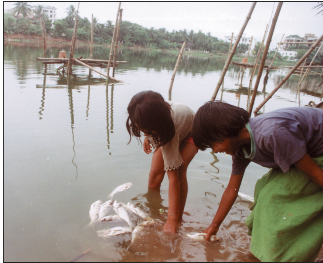
Inhospitable habitat...fishes in Gulshan Lake are dying due to pollution of water. Fish cultivators alleged that toxic waste streaming into the lake from nearby areas has polluted the lake water. But the authorities concerned are yet to ascertain the

The trial of the case began at the Special Court on July 9 last year.