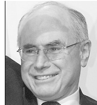
ity after the last election in 1998, holding 11 seats categorised as extreme marginals, with a majority of under one percent.

But with about 40 percent of the national vote counted, the coalition appeared to have won a swing of about two percent and Labour was struggling to pick up ground in New South Wales, Victoria and Queensland.