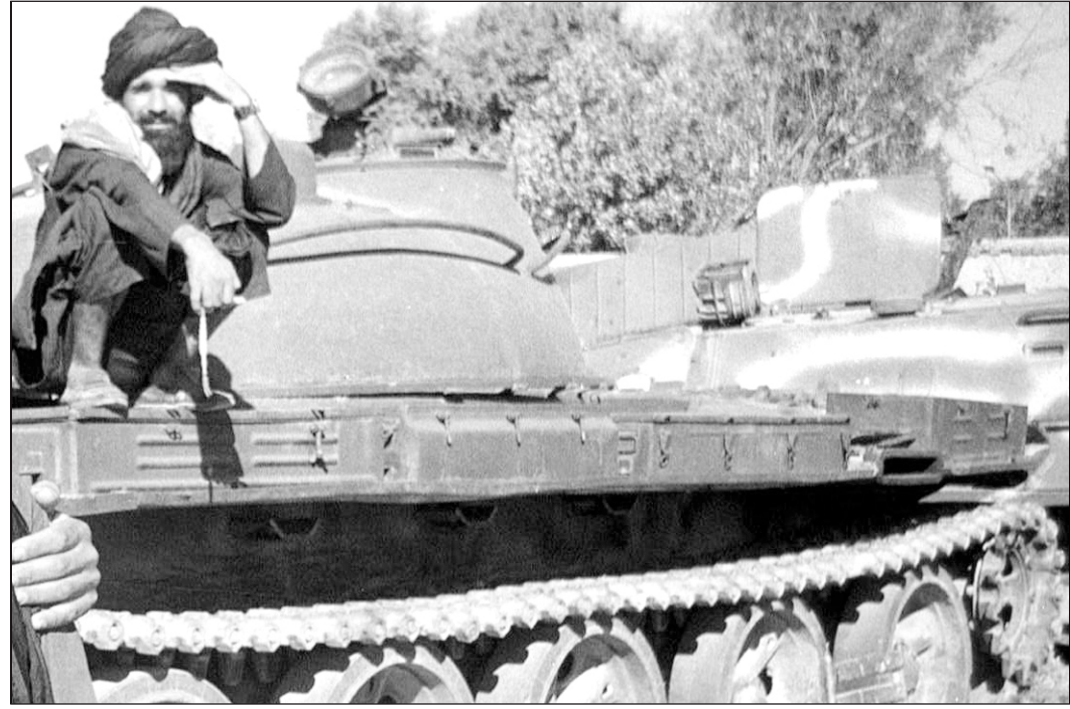
An Afghan Taliban fighter sits on a battle tank pondering his next move in the north of the Afghan capital Kabul on Saturday as the ruling Taliban lost the main northern city of Mazar-i-Sharif to the opposition forces late Friday. Now Taliban forces have been waiting for a major war here in the north of the capital.

Kyoto must be ratified by a sufficient number of industrialised countries in order to enter into force, a process that itself has potential pitfalls.