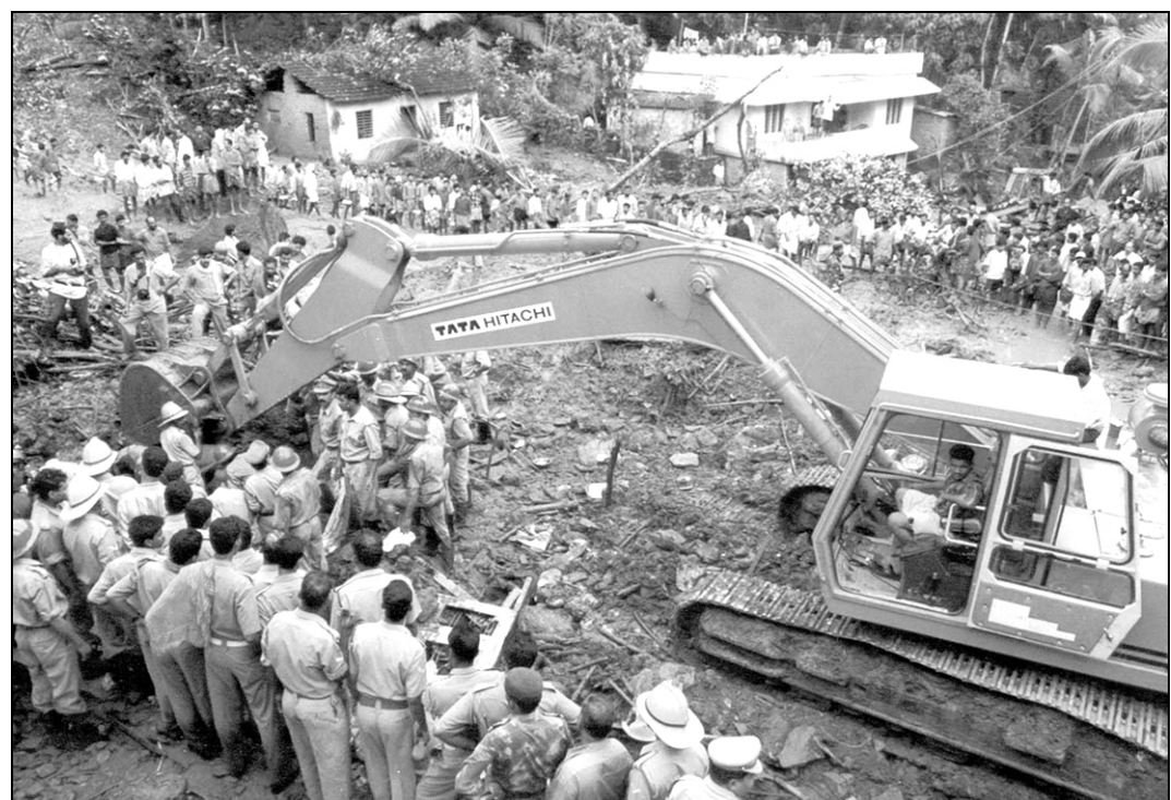
Residents crowd around a bulldozer removing debris after a landslide in Amboori some 30 km from Trivandrum on Saturday. At least 40 people died in the landslide when a house in which they had gathered for a wedding was buried by mud from a hill.