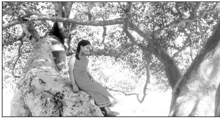
Giribala, a vibrant young girl immortalised in Tagore's 'Megh O Roudro'