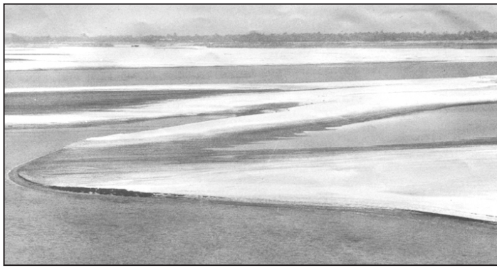
A char-island alongside the bank of River Padma as described in Chhinnapatra

The execution of several slides at a stretch of at least 30 seconds to show the flashing thunderstorm was, to some viewers, unnecessarily lengthy. They were in the opinion that these could easily be illustrated through a single or couple of slides.