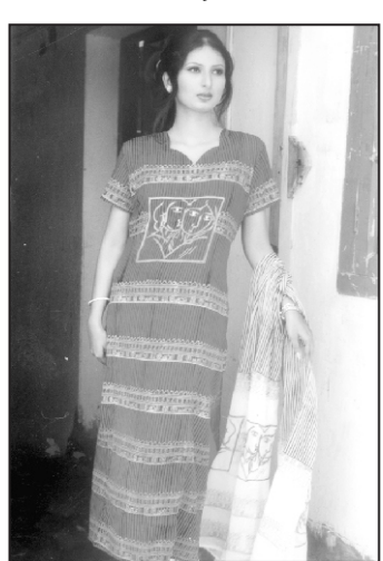
Asalwar kameez in red and black