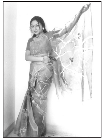
A green muslin saree in hand painting.

The clothes in the current collection, containing Altamira's signature of good materials, great hand paintings and smooth finesse, will be remain on display throughout Ramadan at its own gallery at house no 1 of Road number 2 in Dhanmondi. There will also be a fashion show shortly to present the clothes to the public.