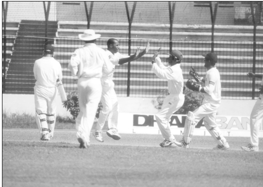
CAUGHT A BIG FISH: Bangladesh left-arm spinner Enamul Haque is the toast of his teammates after capturing the crucial wicket of Zimbabwe star Andy Flower.