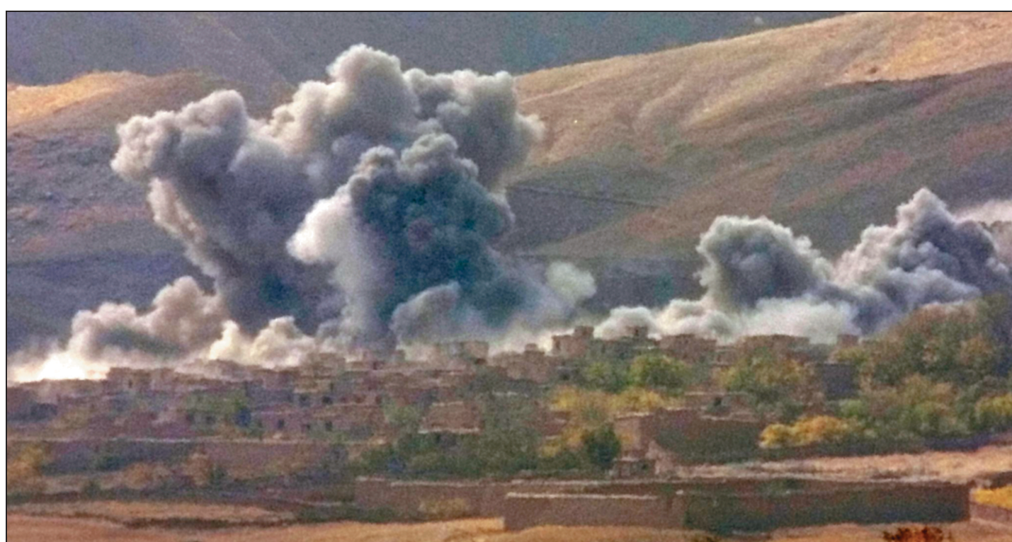
Deep smoke rises up over the Taliban controlled village of Rahisht, not far from Baghran airport and some 25 kilometres north of Kabul yesterday, after US bombers attacked Taliban positions there.